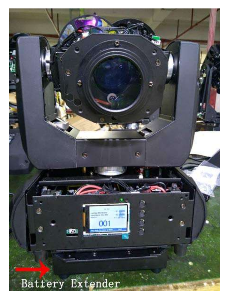
2. Plug in wire to the Extension Port, use.